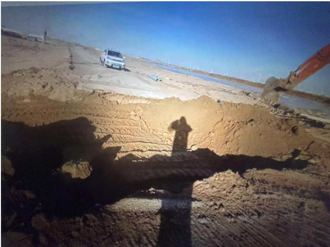
Liansigou Section (2)