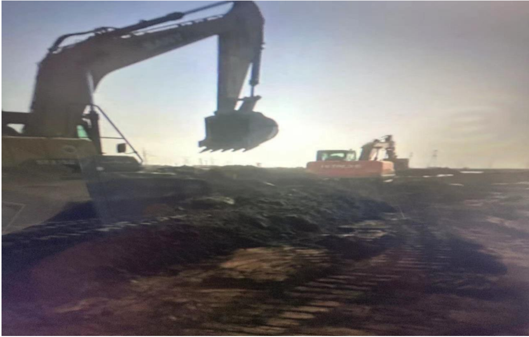
Mi River Section (1)