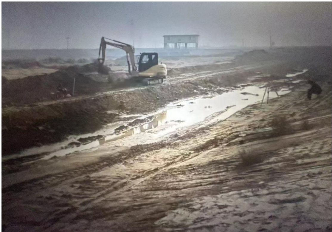
Ta River Section (2)