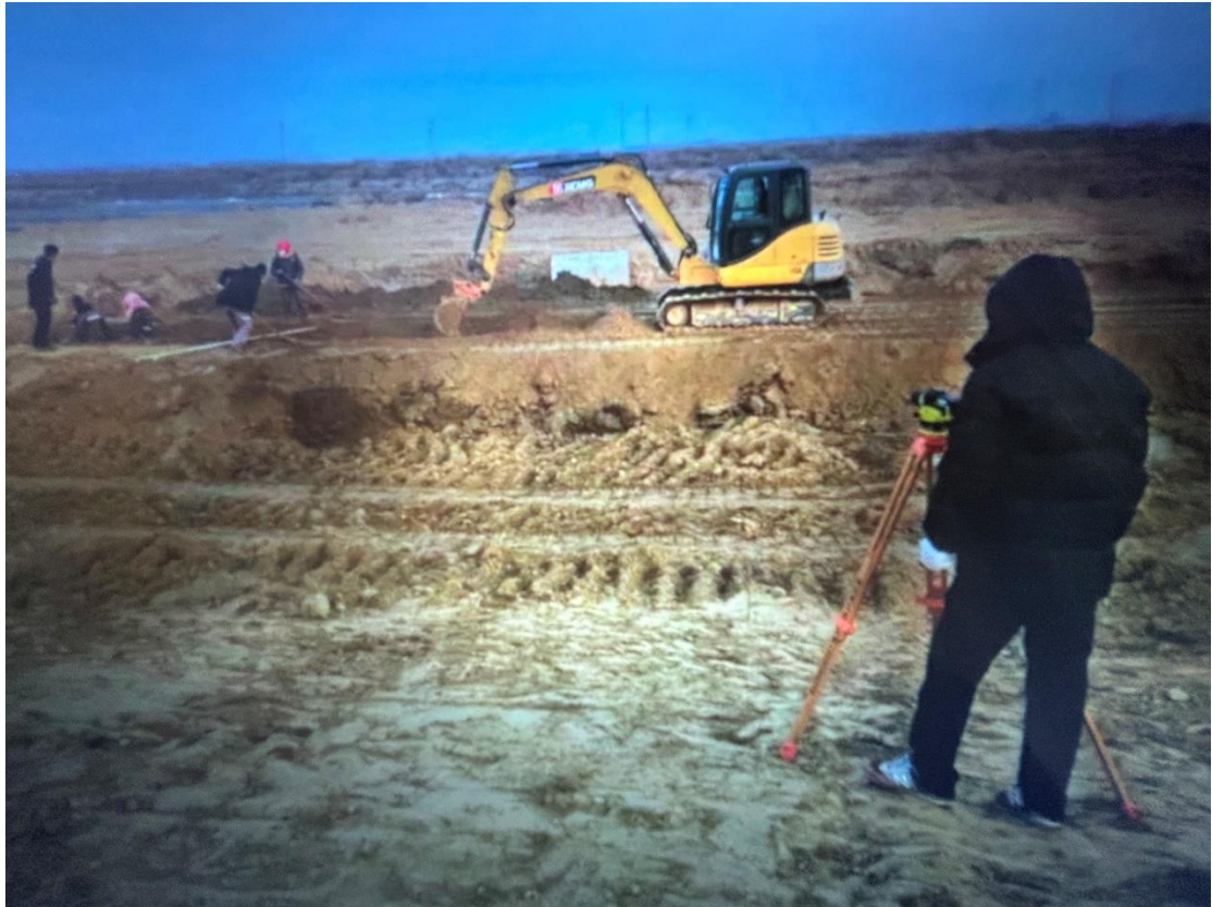
Ta River Section (1)