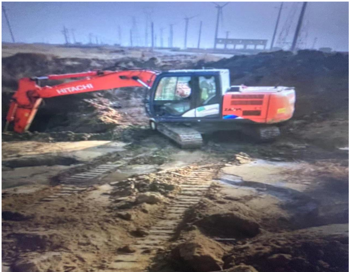
Weitan River Section (2)