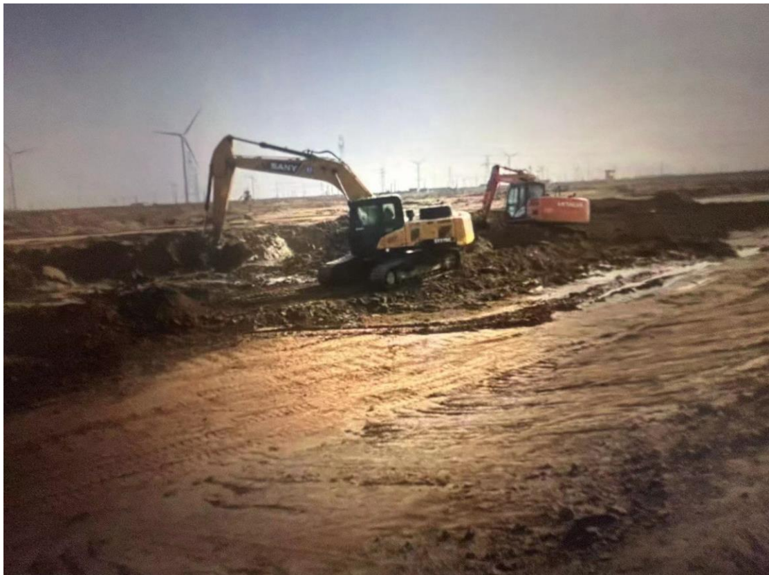
Mi River Section (2)